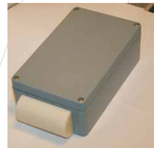
Unit placed under neath the wagon

The JERID Company offers a complex system for objects' monitoring on the railway net consisting of the following parts: