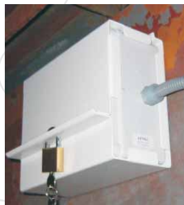
Unit for indoor use